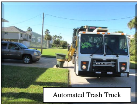
Automated Trash Truck

Be sure NOT to cover any utility meters or connections (water, gas, telephone) with trash. You will be responsible for any damage that occurs during pick-up.